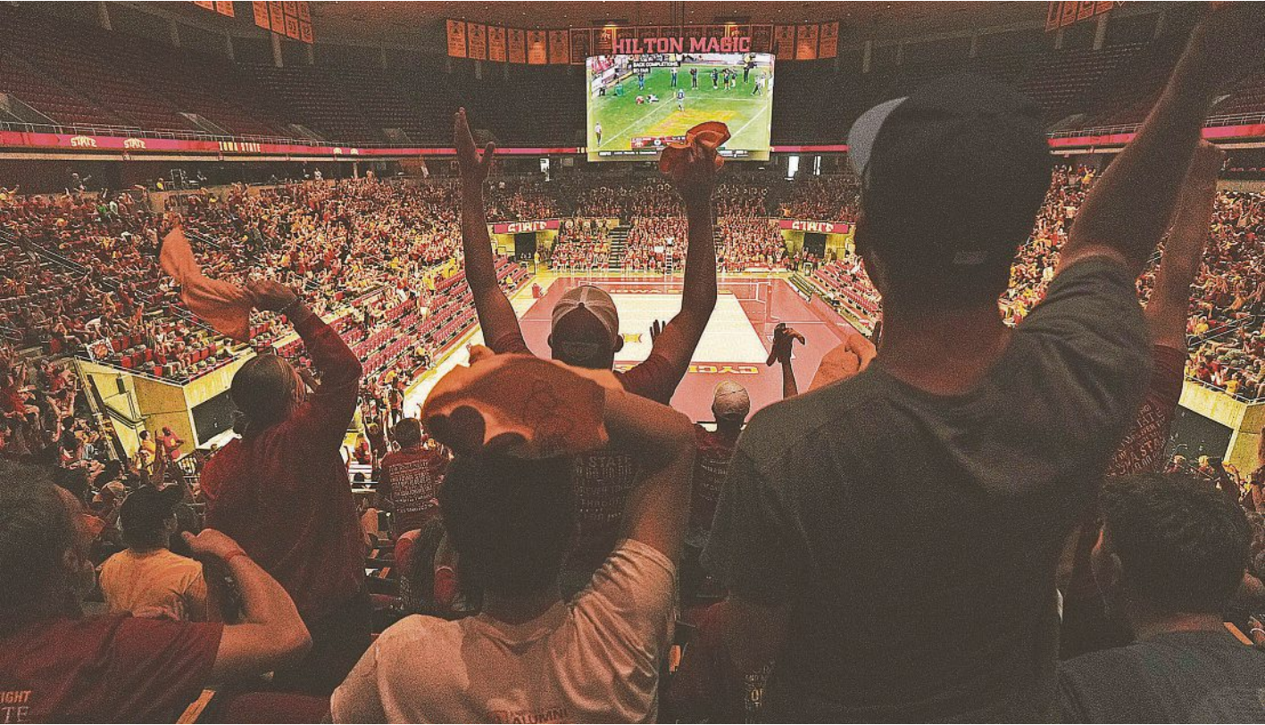
Iowa State fans cheer after a touchdown during a watch party at Hilton coliseum for the Iowa State-Kansas State season-opening game at Aviva Stadium in Dublin on Aug. 23.