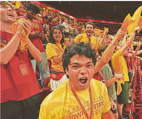
Iowa State fans cheer during a watch party.

BELOW: Iowa State fans cheer during a watch party at Hilton coliseum for the Iowa State-Kansas State season-opening game.