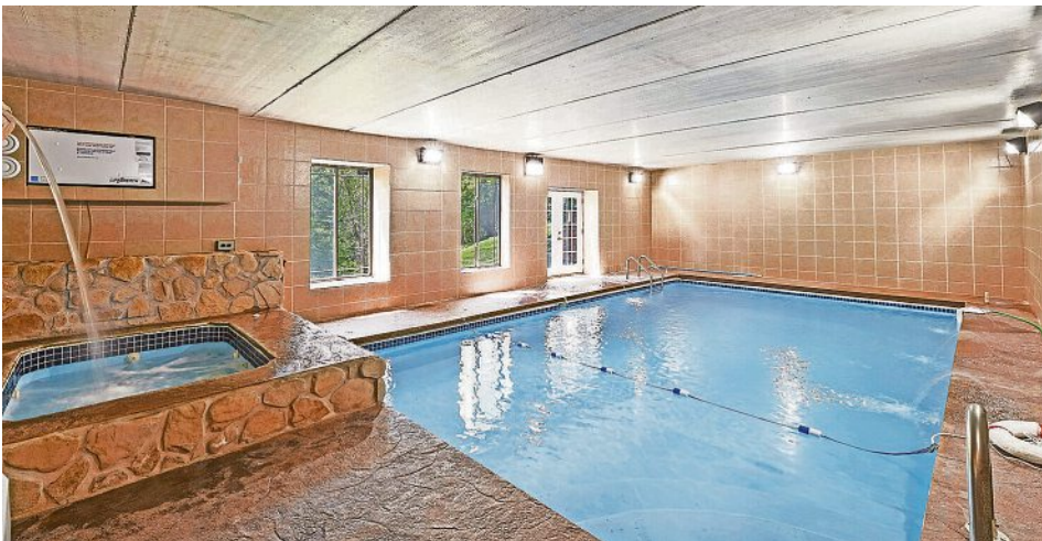
This $1.9 million home at 4408 Cochrane Parkway in Ames features an indoor pool.