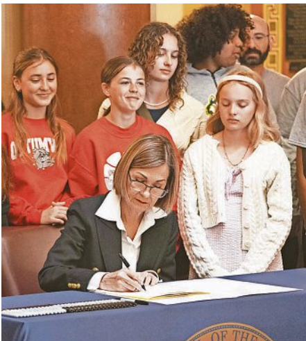
Gov. Kim Reynolds signs a bill at the Iowa State Capitol on April 30 in Des Moines banning cell phones in schools.