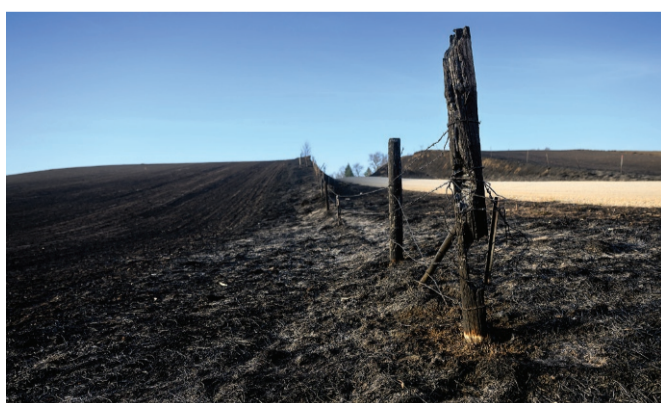
TIM HYNDS, SIOUX CITY JOURNAL

A charred fence post along Emmet Avenue at 170th Street south of Lawton is shown March 30.