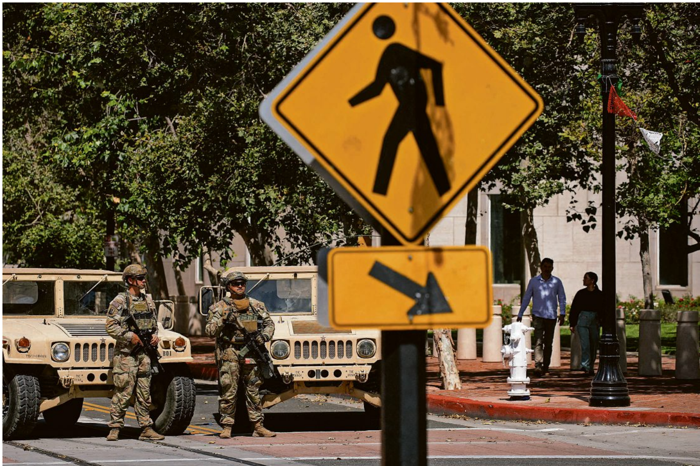
Members of the California National Guard are deployed outside a complex of federal buildings in Santa Ana, California, on June 18.