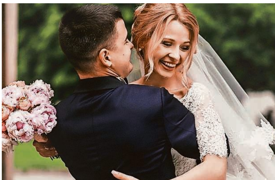
The Knot links wedding services providers and clients. Some providers allege it has sent them false leads.

The vendor, whose name was redacted, was eventually released from the contract. But the complaint has U.S. Sen. Chuck Grassley of Iowa renewing