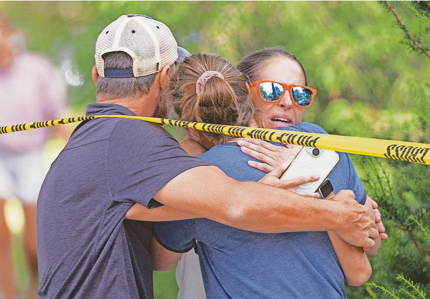
Families and loved ones reunite outside the police barricades after a shooting in Minneapolis on Aug. 27.

THURSDAY, AUGUST 28, 2025 | THE NEWS IOWA DEPENDS UPON | DESMOINESREGISTER.COM PART OF THE USA TODAY NETWORK