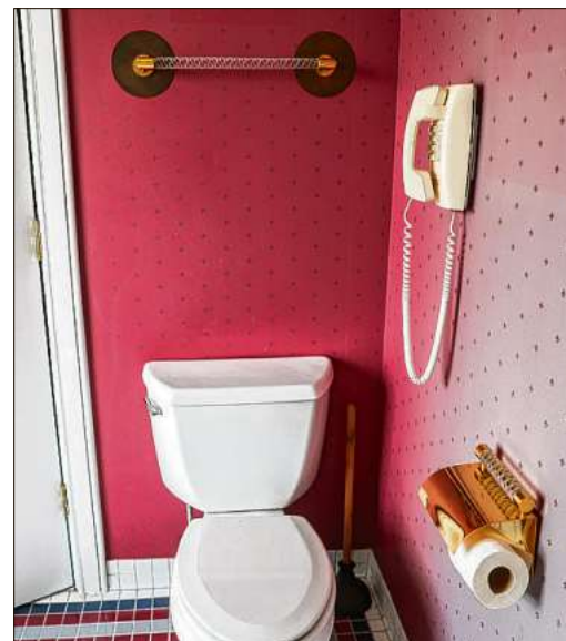
LEFT: Green carpet covers what Jane Fonda once called the "take-your-life-in-your-hands spiral staircase." ABOVE: Yes, that's a landline telephone in the bathroom.