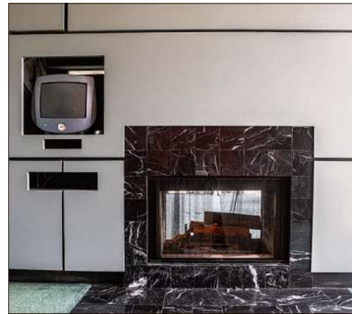
LEFT: The apartment had floor-to-ceiling windows with a striking view of the skyline. ABOVE: A TV that was considered state-of-the-art in the 1990s.