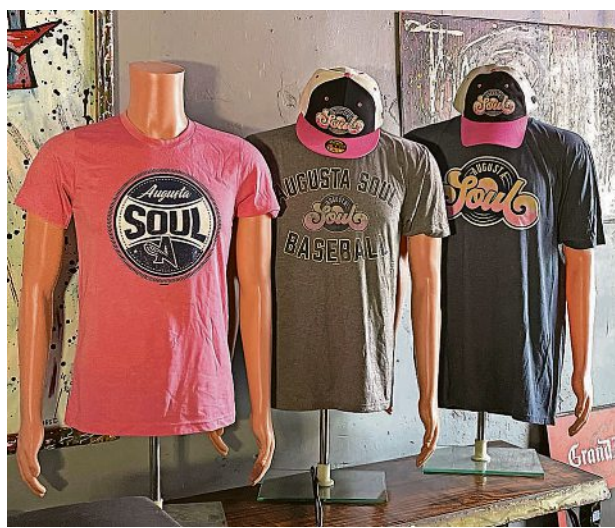
T-shirts and caps showing versions of the Augusta Soul alternate team logo stand on display during an unveiling event for the Augusta GreenJackets' newest brand.