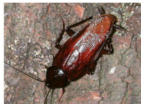
Smoky brown cockroaches are the most common cockroach in suburban, Southern neighborhoods.