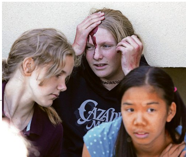
Volunteer students wearing makeup to simulate injuries participate in a school shooting and mass evacuation drill at Lincoln Middle School in 2007 in Alameda, California. So far, the available research shows mixed evidence on whether shooting drills help students feel more prepared or scare them.