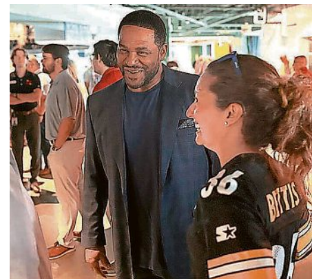
Former NFL player Jerome Bettis, center, chats with fans at Akins Ford Arena where a new professional football team was announced for Athens.