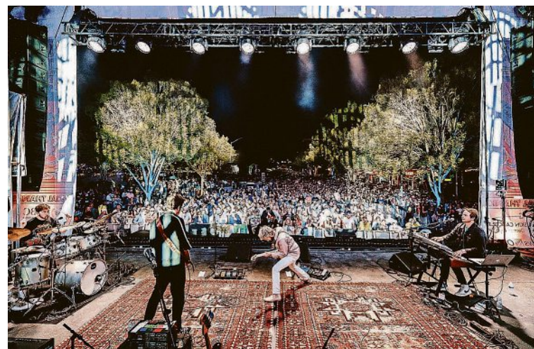
A scene from the Jam in the Streets music festival in downtown Athens that raised more than $1 million for cancer research.