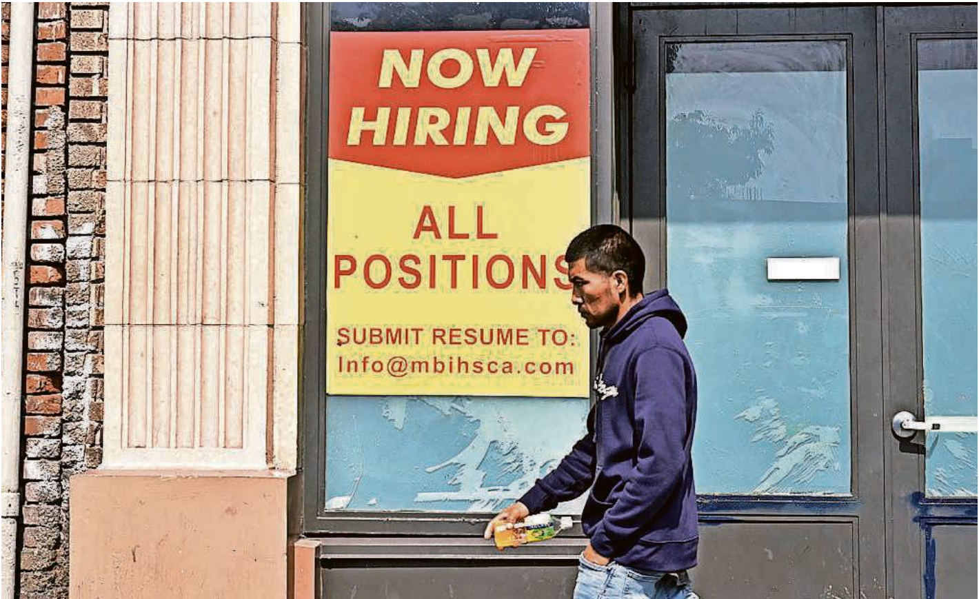
Data on the U.S. economy suggests a wobbling job market due to heightened immigration enforcement and uncertainty from on-again, off-again tariffs.