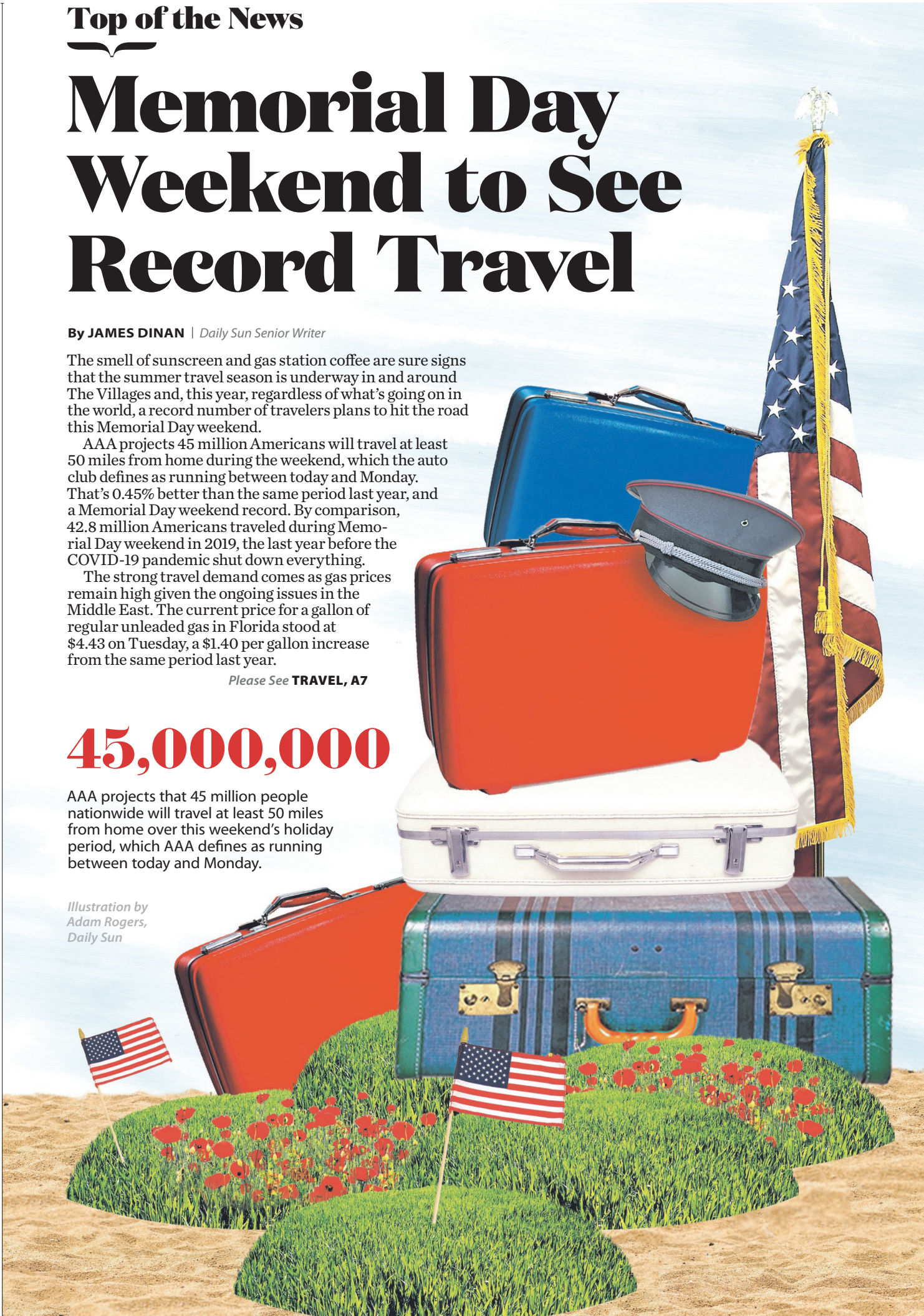
Illustration by Adam Rogers, Daily Sun

AAA projects that 45 million people nationwide will travel at least 50 miles from home over this weekend's holiday period, which AAA defines as running between today and Monday.