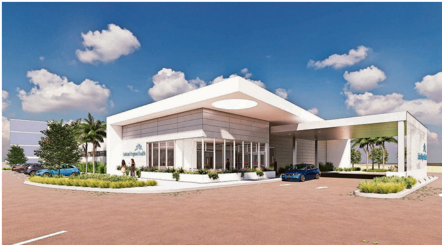
Lakeland Regional Health announced March 31 it plans to open a freestanding emergency department in the Winter Haven area by mid-2027, off Winter Lake Road and U.S 17.