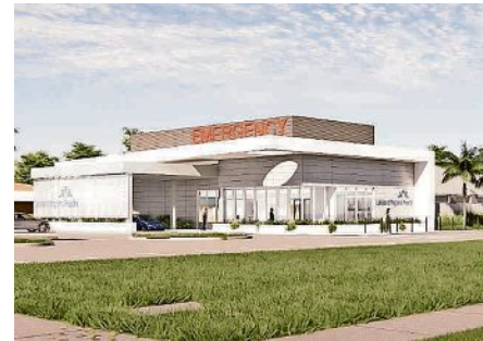
Lakeland Regional Health plans to open its third freestanding emergency department in North Lakeland at U.S. 98 and Marcum Road in early 2028.