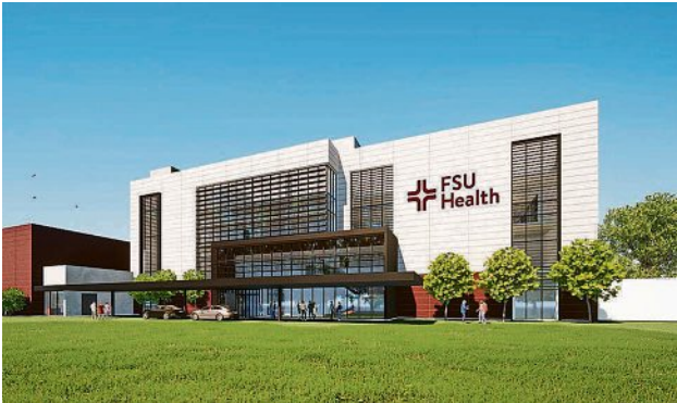
An updated rendering of a future academic health center coming to Surgeons Drive in Tallahassee through a partnership between FSU and TMH.

After months of confidential negotiations, Tallahassee Memorial HealthCare and Florida State University have struck a deal: Pending city commission approval, TMH would become a part of FSU Health with the university taking control of all the city-owned assets of the hospital. The “landmark agreement,” first announced in a Sept. 16 informational email to TMH staff that was obtained by the Tallahassee Democrat, could mean the end of community ownership of the hospital in favor of an academic medical center – a step toward developing a clinical enterprise like the sprawling healthcare system its rival University of Florida has been operating for decades. “Maintaining local control and governance of our See HOSPITAL, Page 2A