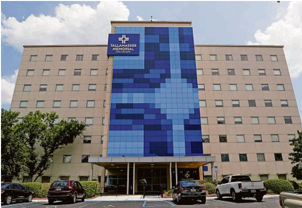
Tallahassee Memorial HealthCare Building Exterior on June 5, 2019.