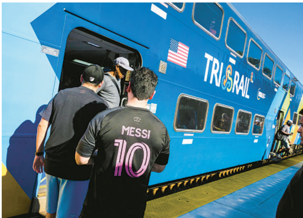
South Florida soccer fans traveling from Fort Lauderdale and surrounding communities have a convenient option for attending Inter Miami CF matches at Nu Stadium: Tri-Rail.