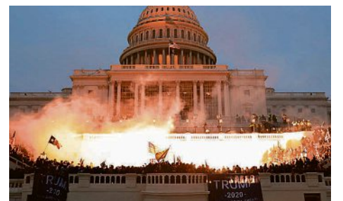
Jan. 6 defendants have recently been thrust back into the spotlight, following President Donald Trump's announcement of a $1.776 billion "anti-weaponization fund."