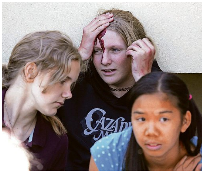
Volunteer students wearing makeup to simulate injuries participate in a school shooting and mass evacuation drill at Lincoln Middle School in Alameda, California. So far, the available research shows mixed evidence on whether shooting drills help students feel more prepared or scare them.