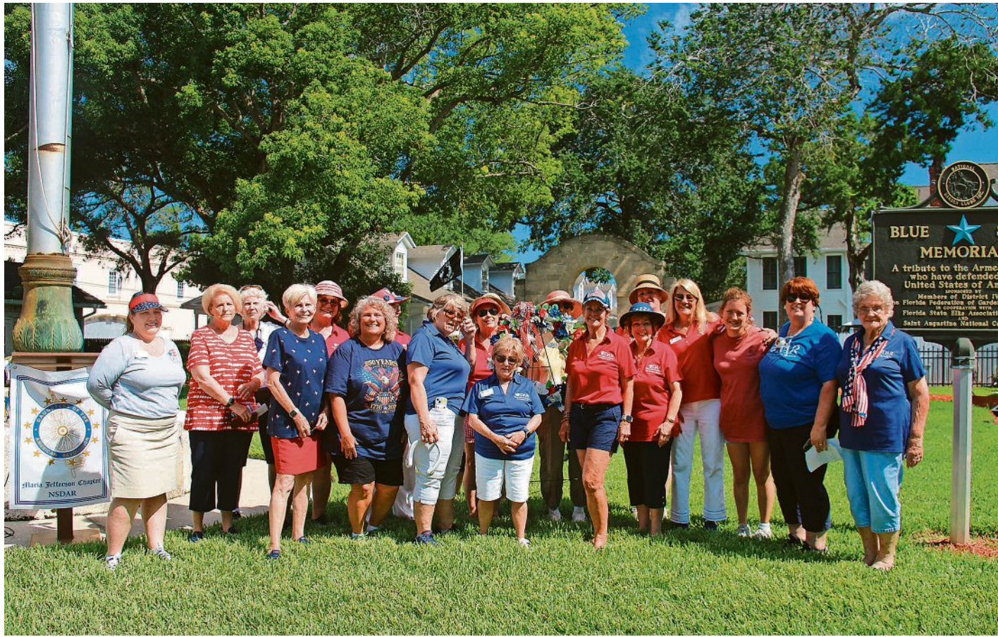
The Maria Jefferson Chapter of the Daughters of the American Revolution celebrated "Flags In" on Friday, July 2 at St. Augustine's National Cemetery. Members of St. Augustine's Maria Jefferson Chapter of the Daughters of the American Revolution.

STAUGUSTINE.COM | PART OF THE USA TODAY NETWORK