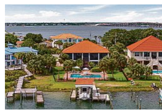
FULLY UPDATED HOME IN COVETED VILLA SABINE NEIGHBORHOOD

112 MATAMOROS DR PENSACOLA BEACH, FL 32561 5 BED | 6 BATH | 5,654 SQ. FT.