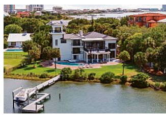
PENSACOLA BEACH HOME WITH INTRACOASTAL DOCK, POOL, AND CROWN'S NEST VIEWS