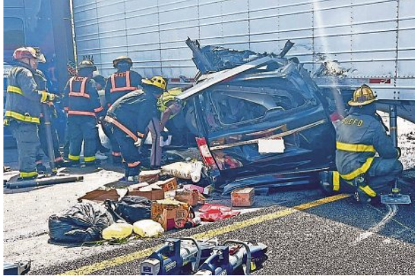
St. Lucie County rescue personnel work the scene of a fatal accident Aug. 12 on Florida’s Turnpike in which three people in a minivan were killed when they slammed into a tractor-trailer that had made an illegal U-turn.