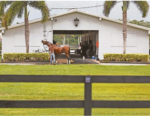
A horse gets some attention at a Heritage Farms stable.