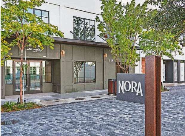
Sunday Motor Co., a New Jersey-based coffee shop, is set to open in the Nora District later this month or early in September.