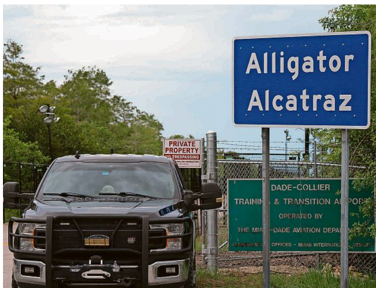
Police officers park outside Alligator Alcatraz in Ochopee during a vigil Aug. 10, 2025.