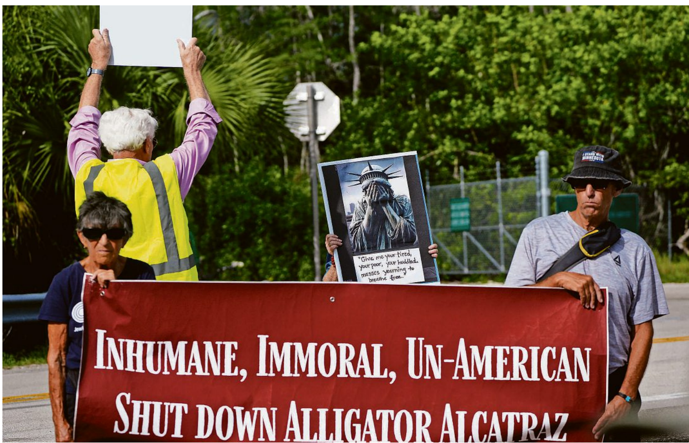
Protesters gather for a weekly vigil across the street from Alligator Alcatraz in Ochopee in Collier County on April 19. Since the opening of the controversial detention center, people have been gathering on Sundays to protest.