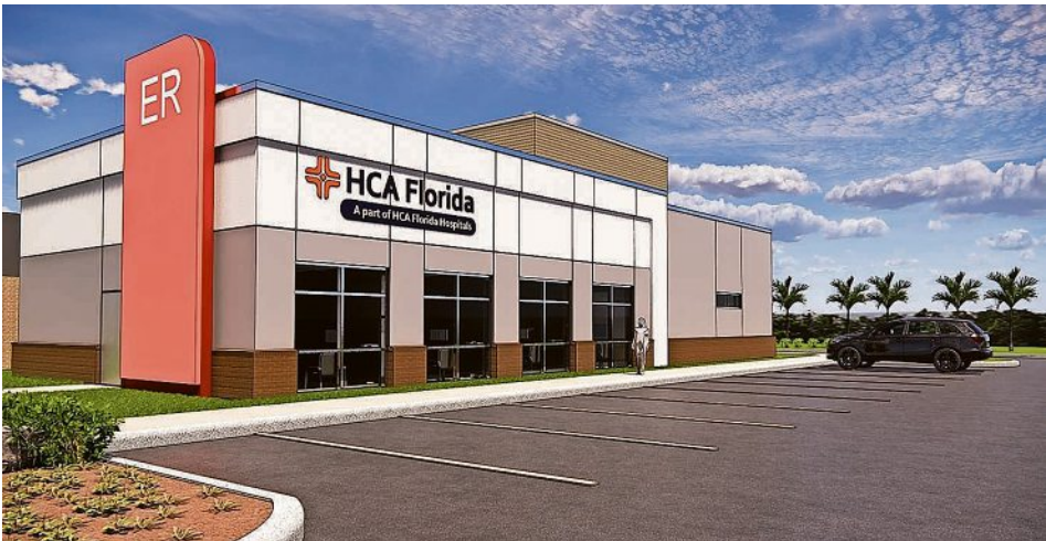
Panama City's expanded HCA Florida Gulf Coast Hospital emergency room is seen in this image render. It is slated to open in late 2026.