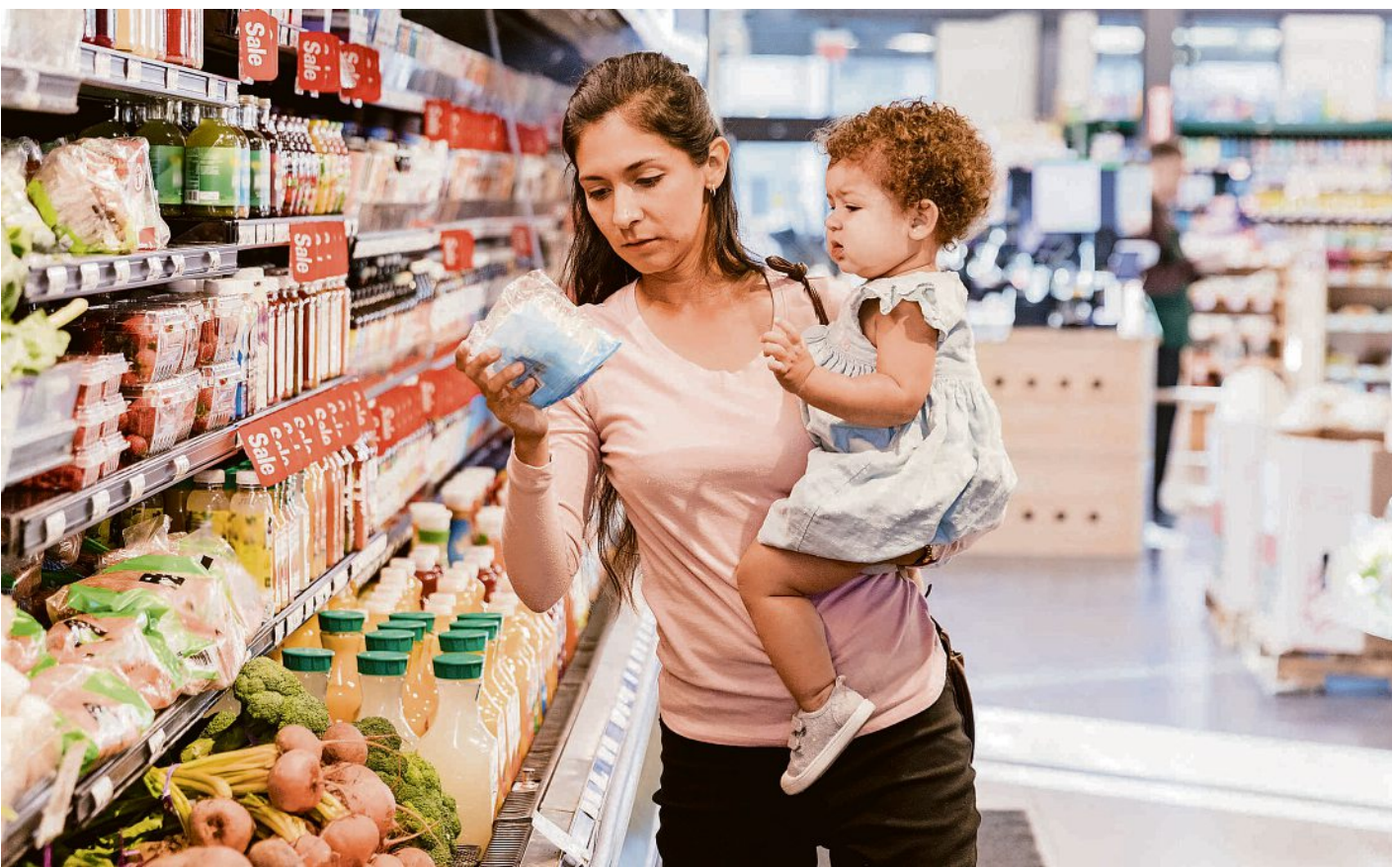
SNAP-Ed taught people how to identify healthy food patterns, keep food safe and navigate a complex food environment. It also taught low-income Americans how to improve their budgeting and planning for meals that balance cost and nutrition.