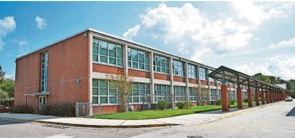
Jacksonville's Stanton College Preparatory ranked sixth in the state.