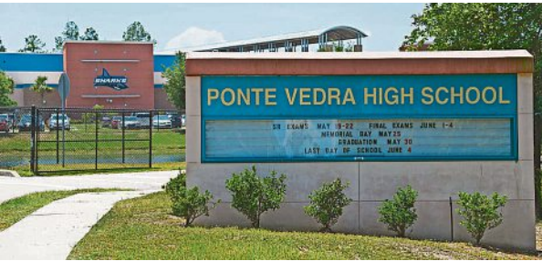
Ponte Vedra High School in St. Johns County was ranked 35th in Florida.