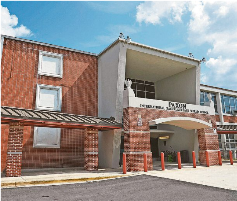
Paxton School for Advanced Studies in Jacksonville came in at 18th in U.S. News’ Florida rankings.