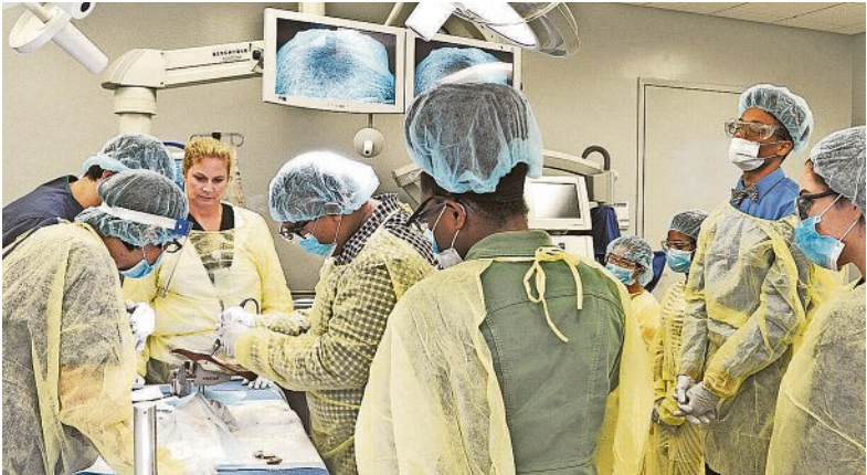
A student at Darnell-Cookman School of the Medical Arts drills into a cow’s scapula during a 2016 instruction session on neuroanatomy where students handled tools used in surgery.

U.S. News ranks 8 First Coast high schools among FL's best