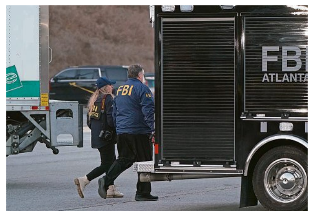
In January, the FBI seized 2020 ballots and other election records from Fulton County, Georgia.