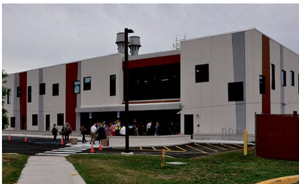
The Department of Natural Resources and Environmental Control's new environmental lab on Sunnyside Road in Smyrna, pictured before the ribbon-cutting ceremony on June 18.