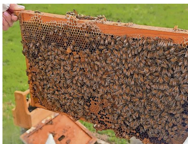
Honey bees cover a hive frame during a spring inspection at the University of Delaware apiary in Newark on April 3.