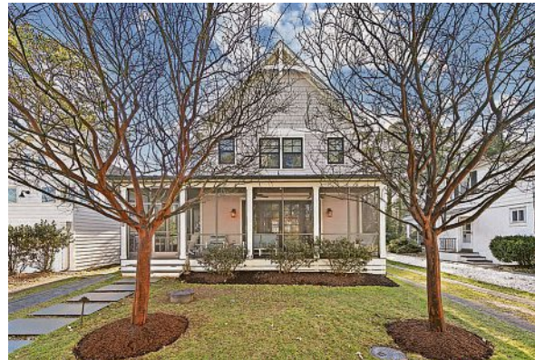
This home at 200 Laurel St., Rehoboth, is 4,552 square feet with 7 bedrooms and 8.5 bathrooms on a 7,841-square-foot lot.