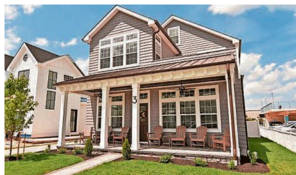
This home at 3 Laurel St., Rehoboth, includes 2,500 square feet with 5 bedrooms and 5.5 bathrooms on a 5,000 square-foot lot.

Ben Mace Delaware News Journal | USA TODAY NETWORK