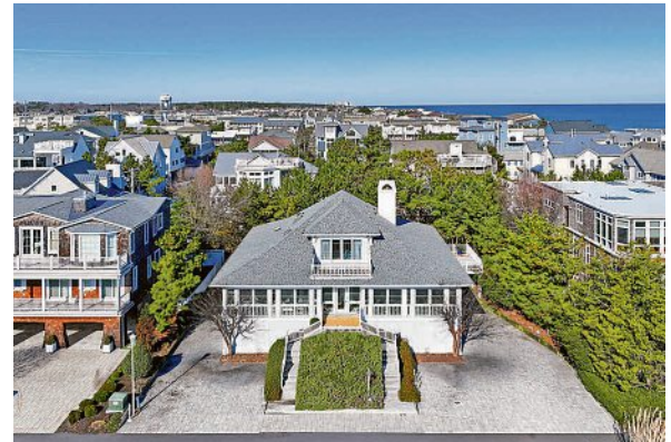
The home at 19 Palmer Ave., a Rehoboth address in the Indian Beach community, includes 3 bedrooms and 4.5 bathrooms.