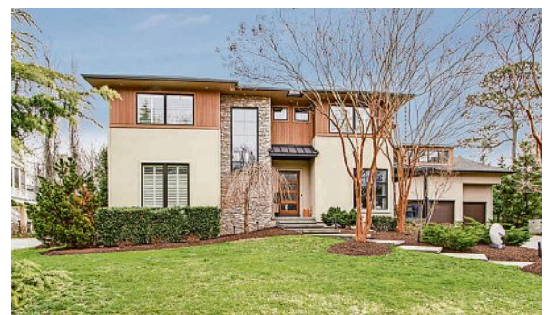
The home at 32 Eleanor Lee Lane East in Rehoboth is 7,572 square feet with 7 bedrooms and 8.5 bathrooms on 0.41 acres.

After one of the worst winters in Delaware in years, you may be dreaming of a beach getaway. But if you can't leave now, you can still enjoy a tour of these top homes for sale in Rehoboth.