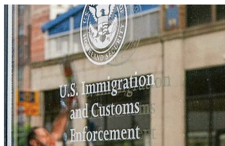
The Immigration and Customs Enforcement field office visitors entrance at 114 N. Eighth Street in Philadelphia on Aug. 1, 2025.