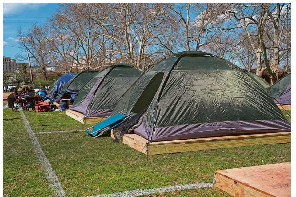
The city of Wilmington brought in pallets, tents and cots for unsheltered people planning to live in Christina Park on April 1.

The tents are meant to bring order, cleanliness and safety to the park, the