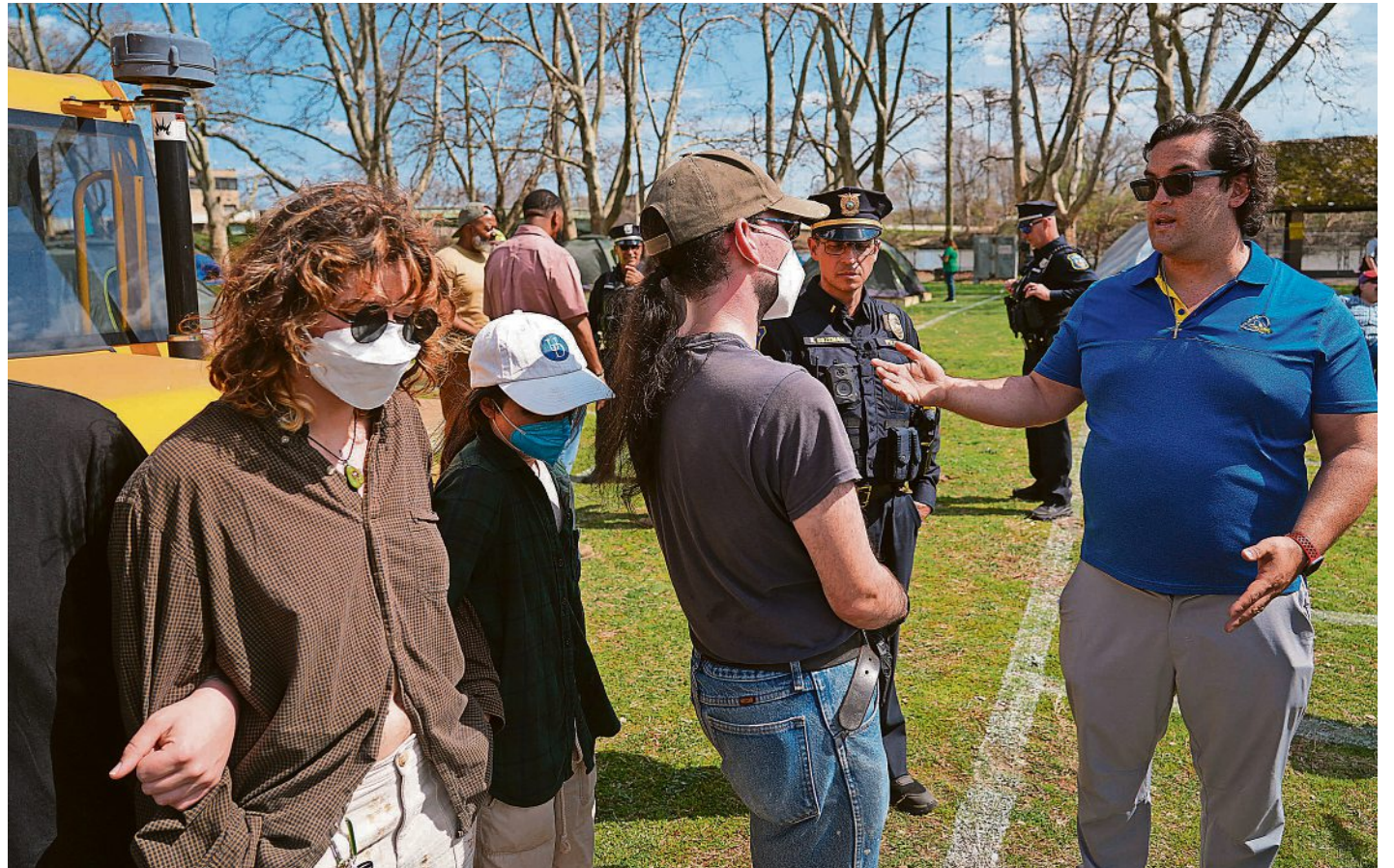
Protesters blocked a forklift trying to install pallets at a homeless encampment at Christina Park on April 1. The group stands with residents who do not want to leave their existing tents.