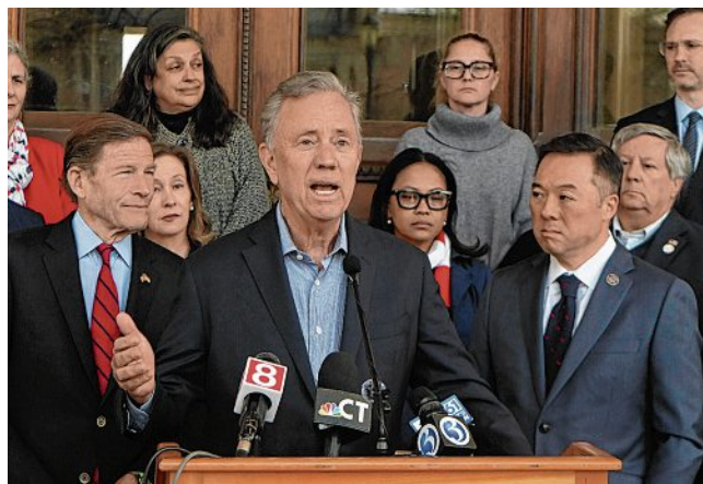
Gov. Ned Lamont is named in the lawsuit.

The lawsuit, filed Monday in federal court, also names Gov. Ned Lamont, Attorney General William Tong and New Haven