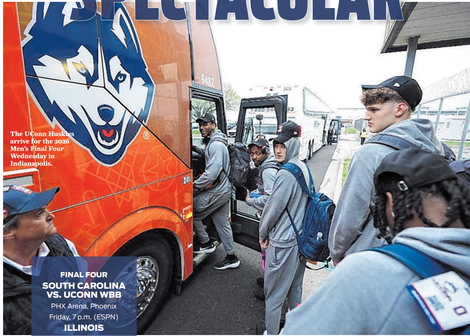
The UConn Huskies arrive for the 2026 Men's Final Four Wednesday in Indianapolis.

FINAL FOUR SOUTH CAROLINA VS. UCONN WBB PHX Arena, Phoenix Friday, 7 p.m. (ESPN) ILLINOIS VS. UCONN MBB Lucas Oil Stadium, Indianapolis Saturday, 6:09 p.m. (TBS)