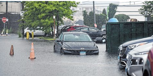
A car is parked in a flooded area during a storm in Stamford on Aug. 18, 2024. The state is suing the Trump administration over the loss of $84 million in federal disaster funds.

Tong said during a Wednesday news conference in Stamford. "For more than 30 years, states and municipalities have depended on Disaster continues on A4