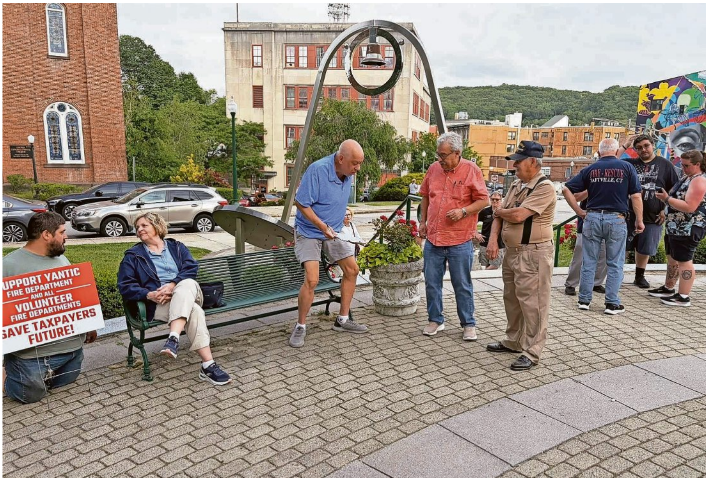
Dozens rallied outside Norwich City Hall in support of the Norwich volunteer firefighters before the Public Safety Meeting on June 10.