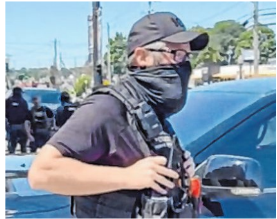
An ICE agent is seen in a screen grab of a video in Danbury after arrests were made June 4. The agent is wearing a mask despite a recently signed state law banning them.