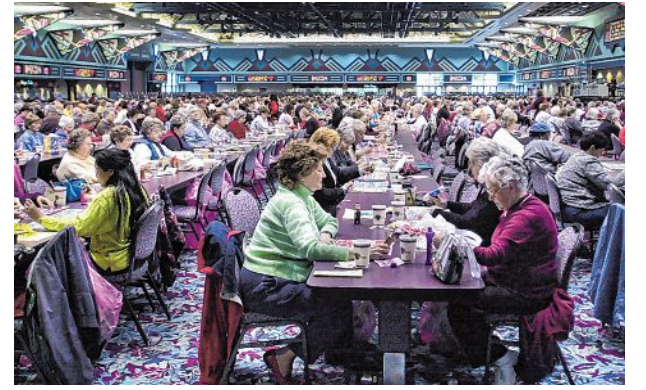
People play high-stakes bingo at Foxwoods Casino in March 2002.

Connecticut has made around $22 billion on the gambling industry since the lottery was started in 1972, according to records from the Connecticut Department of Consumer Protection. That sum in-