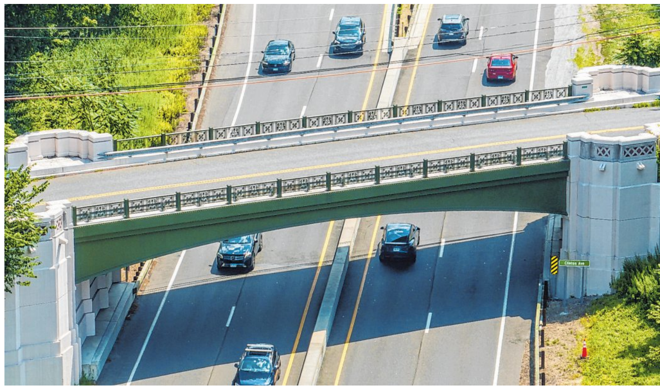
The Clinton Avenue Bridge over the Merritt Parkway in Westport after its restoration.