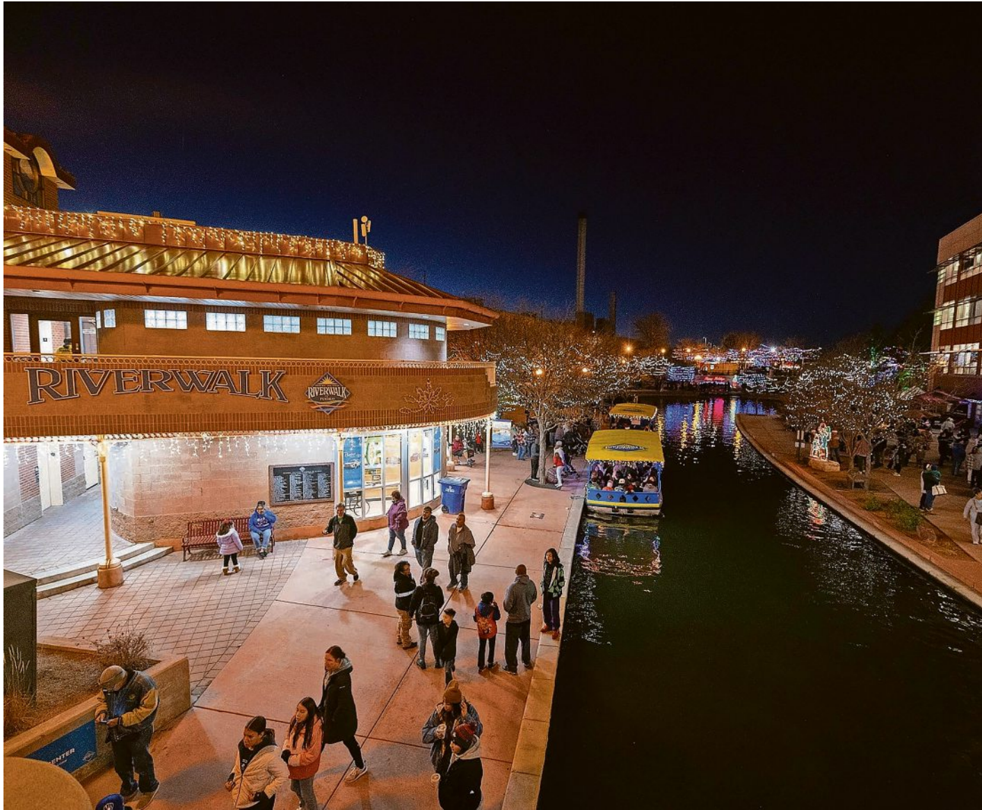
Visitors file in at the Pueblo Riverwalk during the 24th annual Holiday Lighting Extravaganza on Nov. 28, 2025.