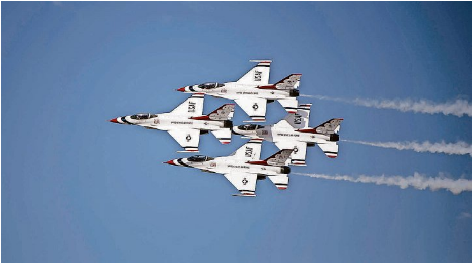
The U.S. Air Force Thunderbirds fly in a diamond formation above Pueblo Memorial Airport during the Wings of Pride air show on Sept. 27.

Fighter jets, sky divers and several daring stunt pilots put on an astounding aerial display in Pueblo over the week-end during the first Wings of Pride air show at Pueblo Memorial Airport. The two-day event marked the first appearance of the world-renowned U.S. Air Force Thunderbirds in Pueblo in three decades and featured ground displays of military and civilian aircraft, as well as performances from the U.S. Army Golden Knights — the Army’s official parachute demonstration — and several stunt pilots. Here are some of the Chieftain’s top photos from the Wings of Pride air show.