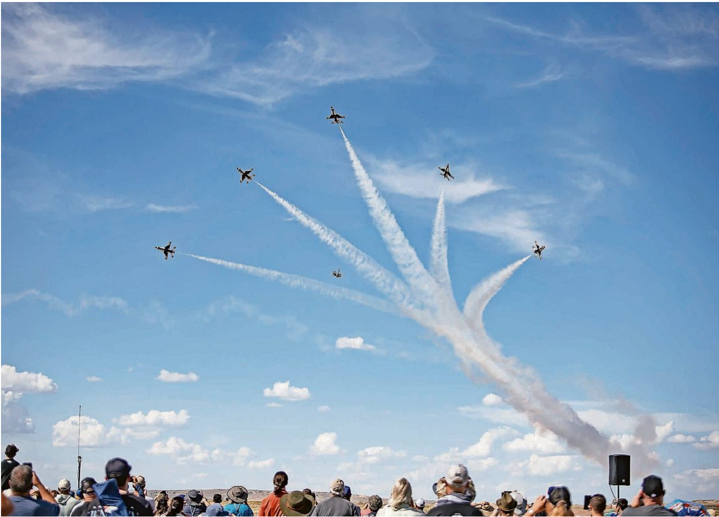
Spectators watch the U.S. Air Force Thunderbirds perform the “Delta Burst” during the Pueblo Wings of Pride air show at Pueblo Memorial Airport on Sept. 27.