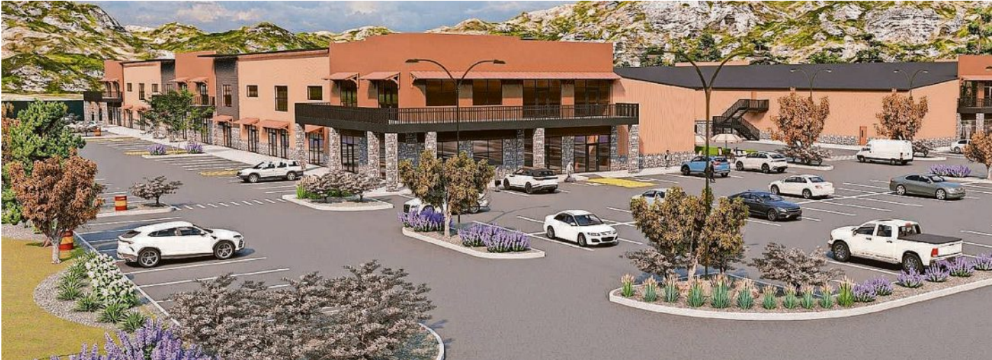
A rendering of the first phase of the forthcoming Wellington Business Center project. CUSHMAN & WAKEFIELD/PROVIDED BY THE TOWN OF WELLINGTON