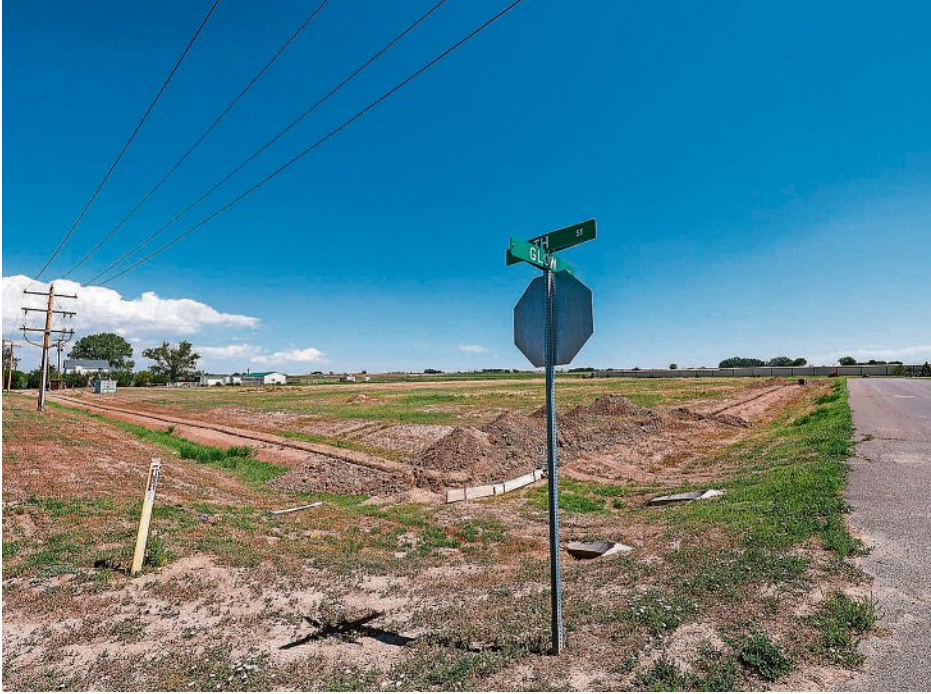
The site of Kaufman & Robinson Inc.'s new manufacturing and research facility at Glow Avenue and Sixth Street in Wellington.

A trio of major developments are in the works in Wellington, potentially bringing more retail options, manufacturing jobs and housing to the small, but growing, Northern Colorado town. The Wellington Business Center, a 95,000-square-foot, retail-focused mixed-use development, is set to break ground on the first phase of its development later this year, according to a news release from the town. Work is slated to begin this fall on a new 50,000-square-foot Wellington facility for Kaufman & Robinson Inc., a Fort Collins-based company that engineers and manufactures broad beam ion and plasma products, the release added. And Sage Farms, a master-planned housing community proposed on the