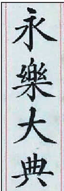
The Chinese characters for Yongle Dadian, using the newly developed digital font.