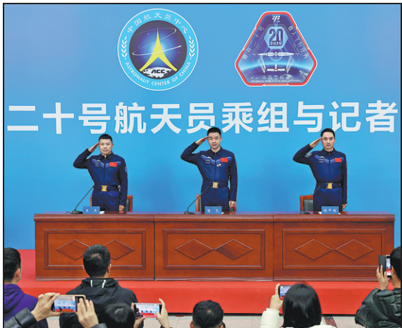
Shenzhou XX astronauts Wang Jie (left), Chen Dong (center) and Chen Zhongrui (right) meet the media at a news conference in Beijing on Friday. This marked the first official public appearance of the Shenzhou XX crew after returning to Earth on Nov 14 last year. See story, page 3