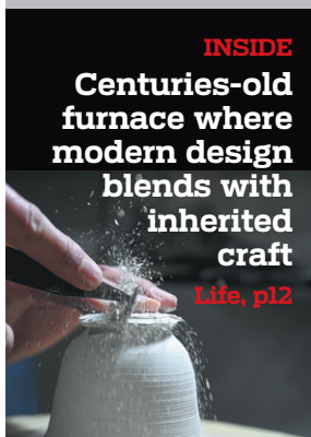
INSIDE Centuries-old furnace where modern design blends with inherited craft Life, p12 国内统一连续出版物号: CN 11-0091 国际标准连续出版物号: ISSN 0253-9543 代号: 1-3 © 2026 China Daily All Rights Reserved Vol. 46 — No. 14249 9 640844 00150 9 ANN ASIA NEWS NETWORK A member of the Asia News Network