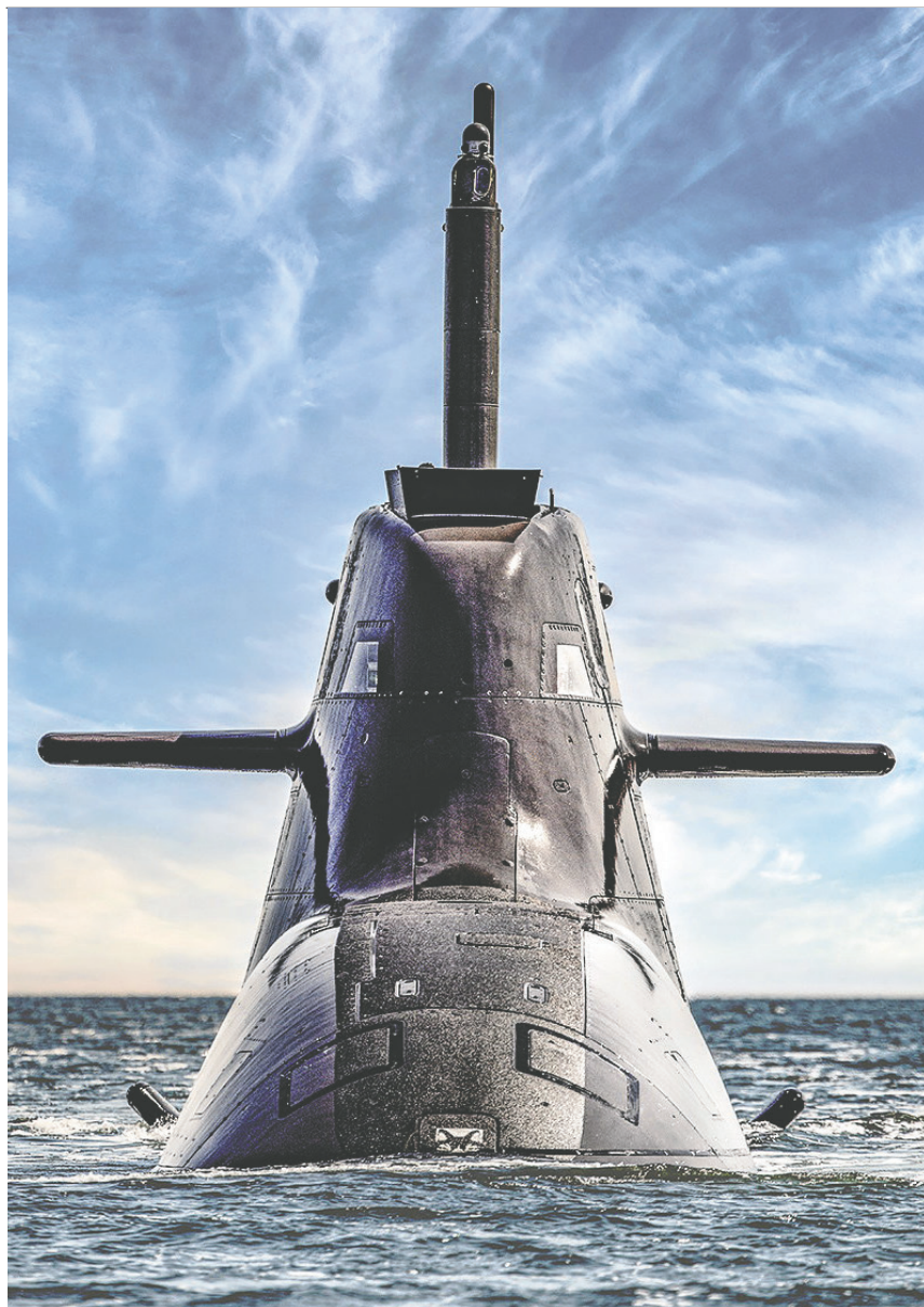
Canada is buying 12 German-Norwegian designed Type 212CD submarines based on the existing Type 212A, shown.