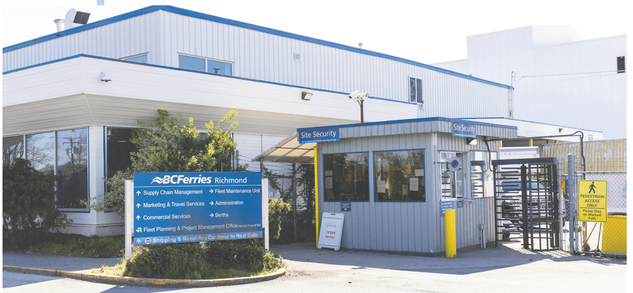
The women kidnapped in a violent home invasion in east Vancouver in 2023 say they found help after fleeing the car they were abandoned in and walking to this B.C. Ferries maintenance yard in Richmond.