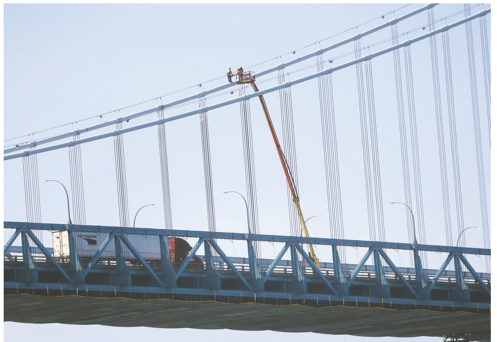
The Ambassador Bridge, above, trails Sarnia's Blue Water Bridge as the No. 1 trading crossing to the U.S. DAN JANISSE