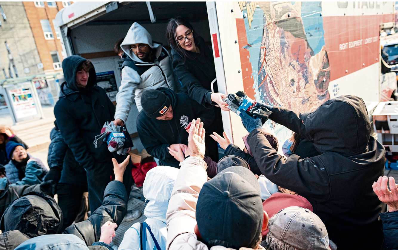
Clothing and other gifts from a mystery donor were handed out from a U-Haul near the Scott Mission on Thursday.

Anonymous donor's Christmas gifts brighten spirits at Scott Mission A6