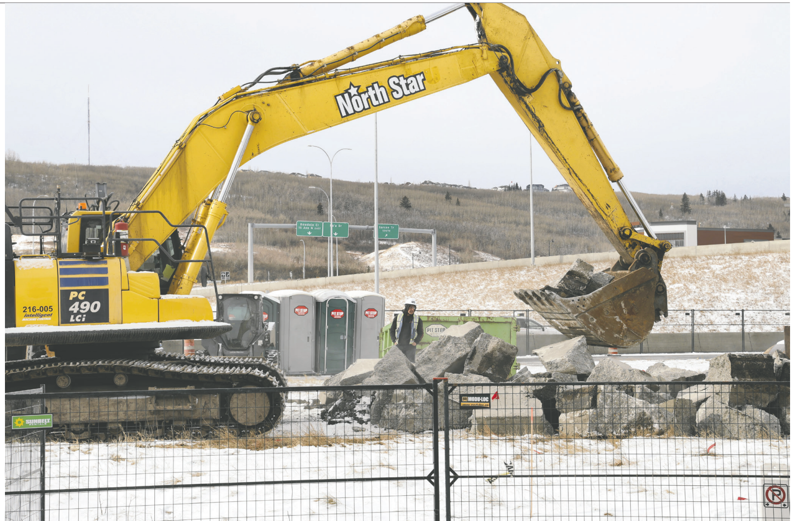
Crews begin work to reinforce the Bears paw South feeder main at a repair site on 16th Avenue at Sarcee Trail N.W. on Monday. GAVIN YOUNG

Green Shirt Day supports a 'crucial' cause A6