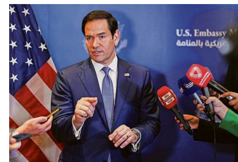
Secretary of State Marco Rubio on June 25 reassured Gulf allies wary of Washington's preliminary accord with Tehran.