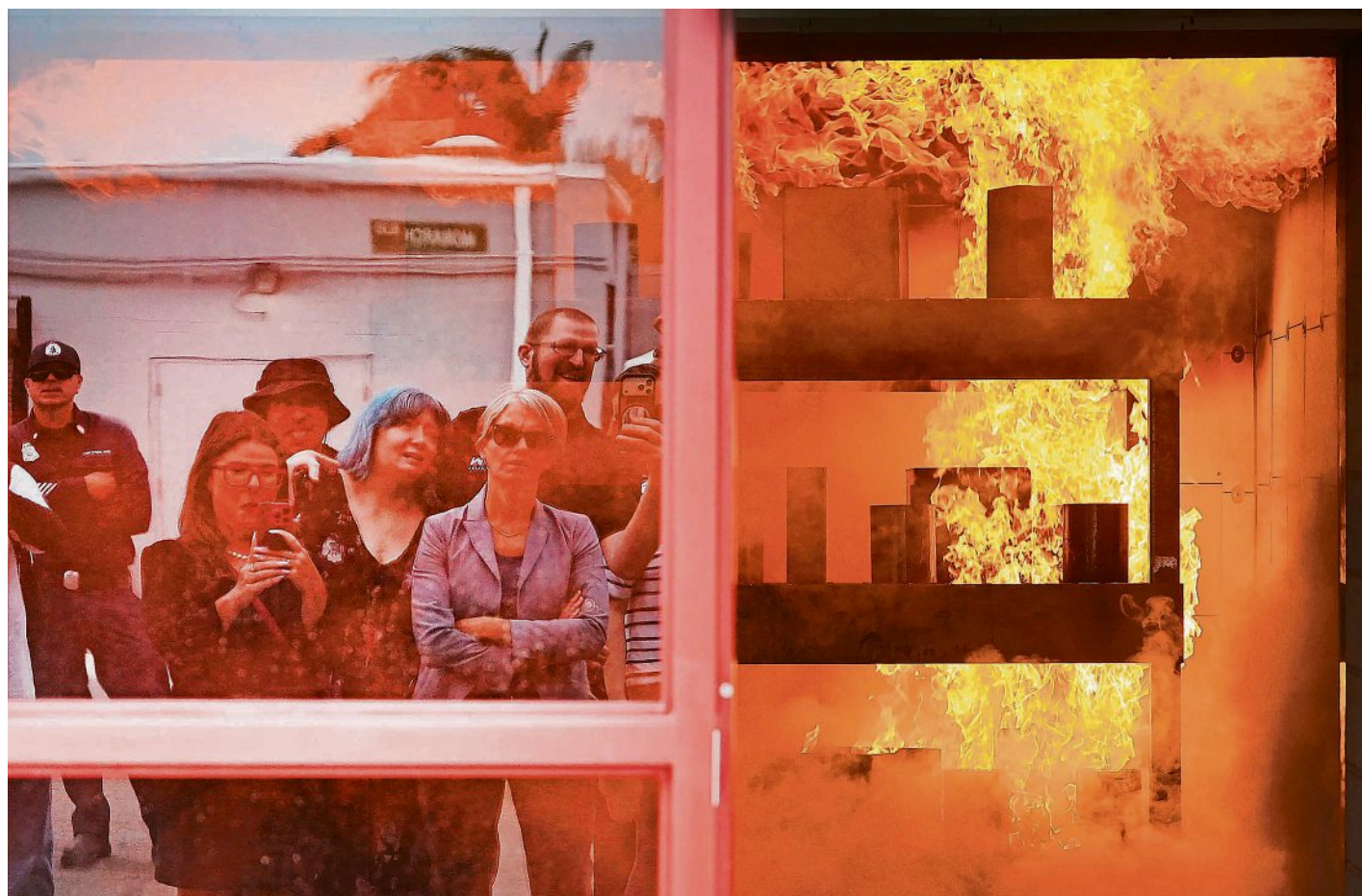
A large group tours the Ventura County Fire Department's $32.5 million live-fire training facility on June 24. In this demonstration, the scenario simulates a kitchen fire at a strip mall.