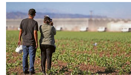
A man and woman stand in an agricultural field and watch as vans exit the Glass House facility off Laguna Road near Camarillo during a federal immigration raid July 10, 2025.