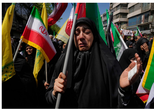
A government supporter weeps during a mourning ceremony marking the 40th day since the death of Iranian Supreme Leader Ayatollah Ali Khamenei, who was killed in the U.S. and Israel strikes in Tehran, Iran, on Thursday.