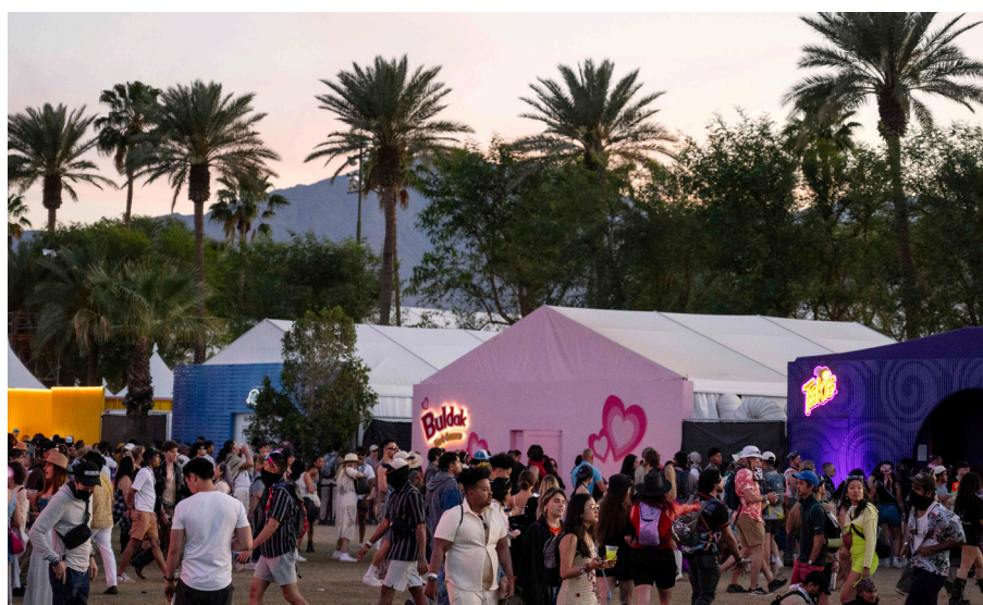
Weekend 2 of the Coachella Valley Music and Arts Festival in Indio on April 20.

It wasn't a seamless transition. After the first festival in October 1999 was awash in red ink, it took promoter Goldenvoice a year and a half to try again — and then in a stripped-down, one-day format. From that uneven start, the festival began to grow steadily, expanding to three days and adding the