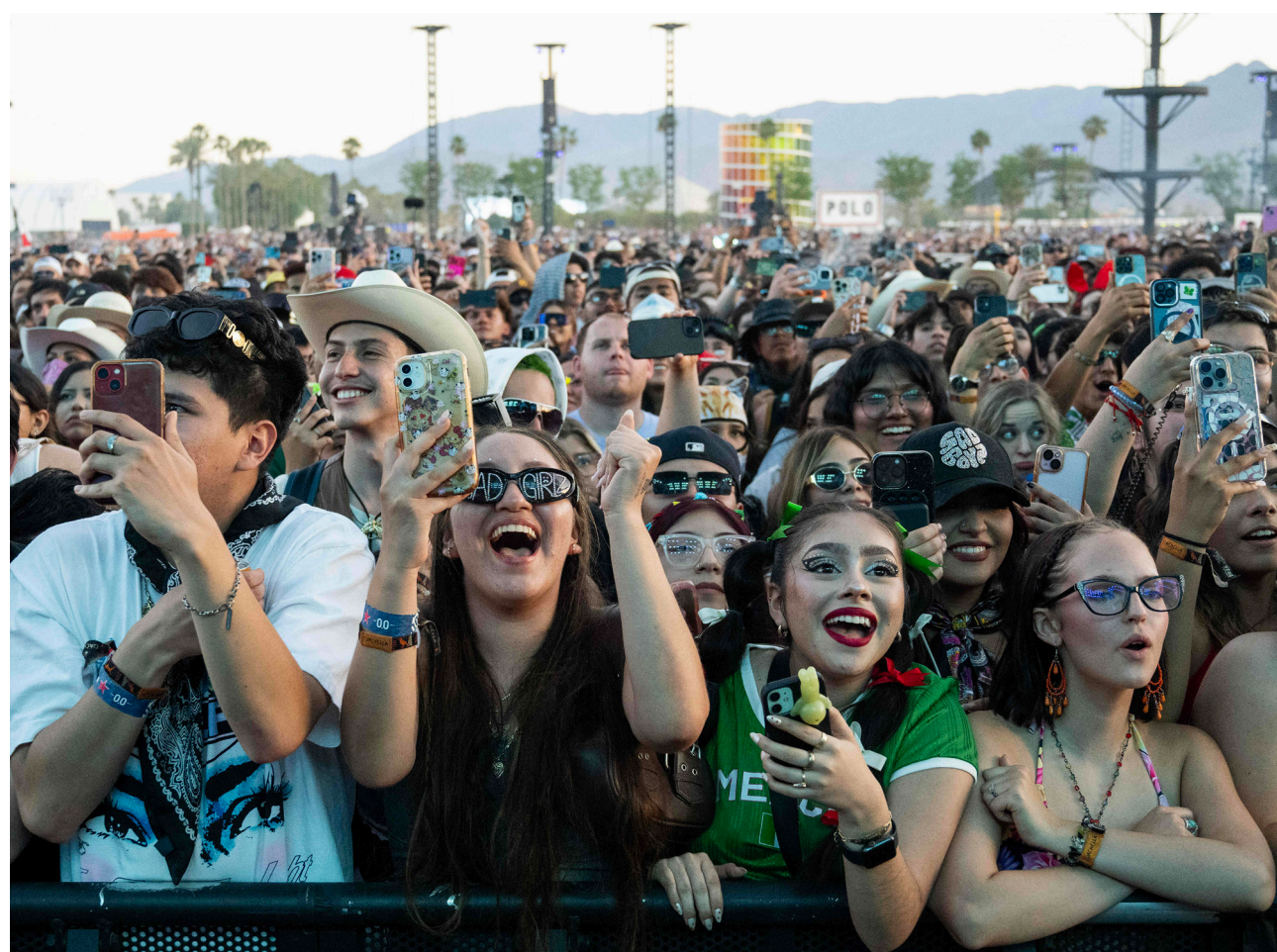
Fans of Junior H react to his performance on the main stage during Weekend 2 of the Coachella Valley Music and Arts Festival in Indio's Empire Polo Field last year.

Today launches 2 sold-out weekends of world-famous music showcase