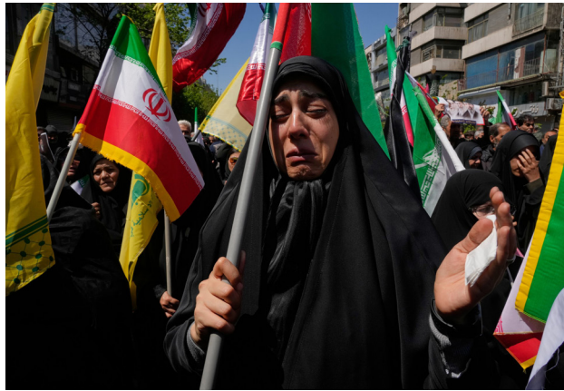
A government supporter weeps during a mourning ceremony marking the 40th day since the death of Iranian Supreme Leader Ayatollah Ali Khamenei, who was killed in the U.S. and Israel strikes in Tehran, Iran, on Thursday.