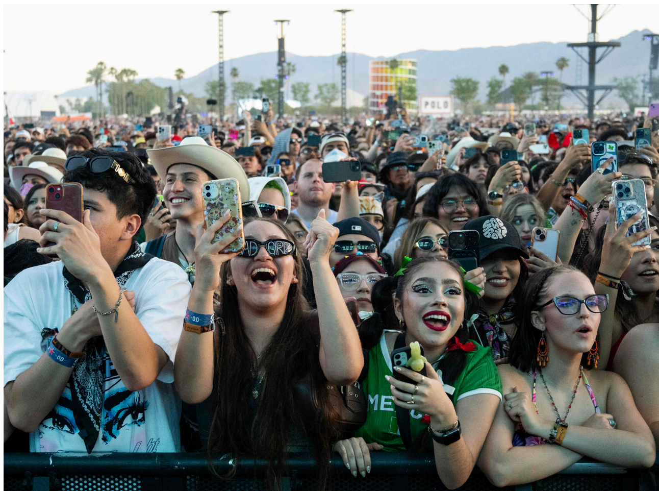
Fans of Junior H react to his performance on the main stage during Weekend 2 of the Coachella Valley Music and Arts Festival in Indio's Empire Polo Field last year.

Today launches 2 sold-out weekends of world-famous music showcase