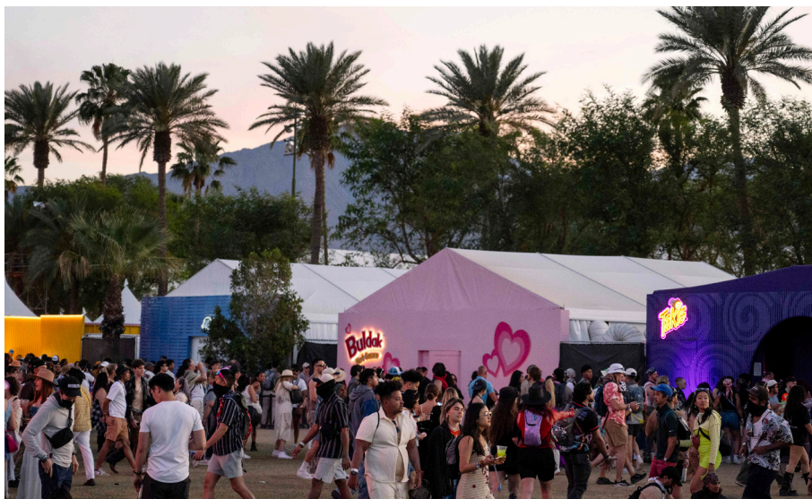
Weekend 2 of the Coachella Valley Music and Arts Festival in Indio on April 20.

It wasn't a seamless transition. After the first festival in October 1999 was awash in red ink, it took promoter Goldenvoice a year and a half to try again — and then in a stripped-down, one-day format. From that uneven start, the festival began to grow steadily, expanding to three days and adding the