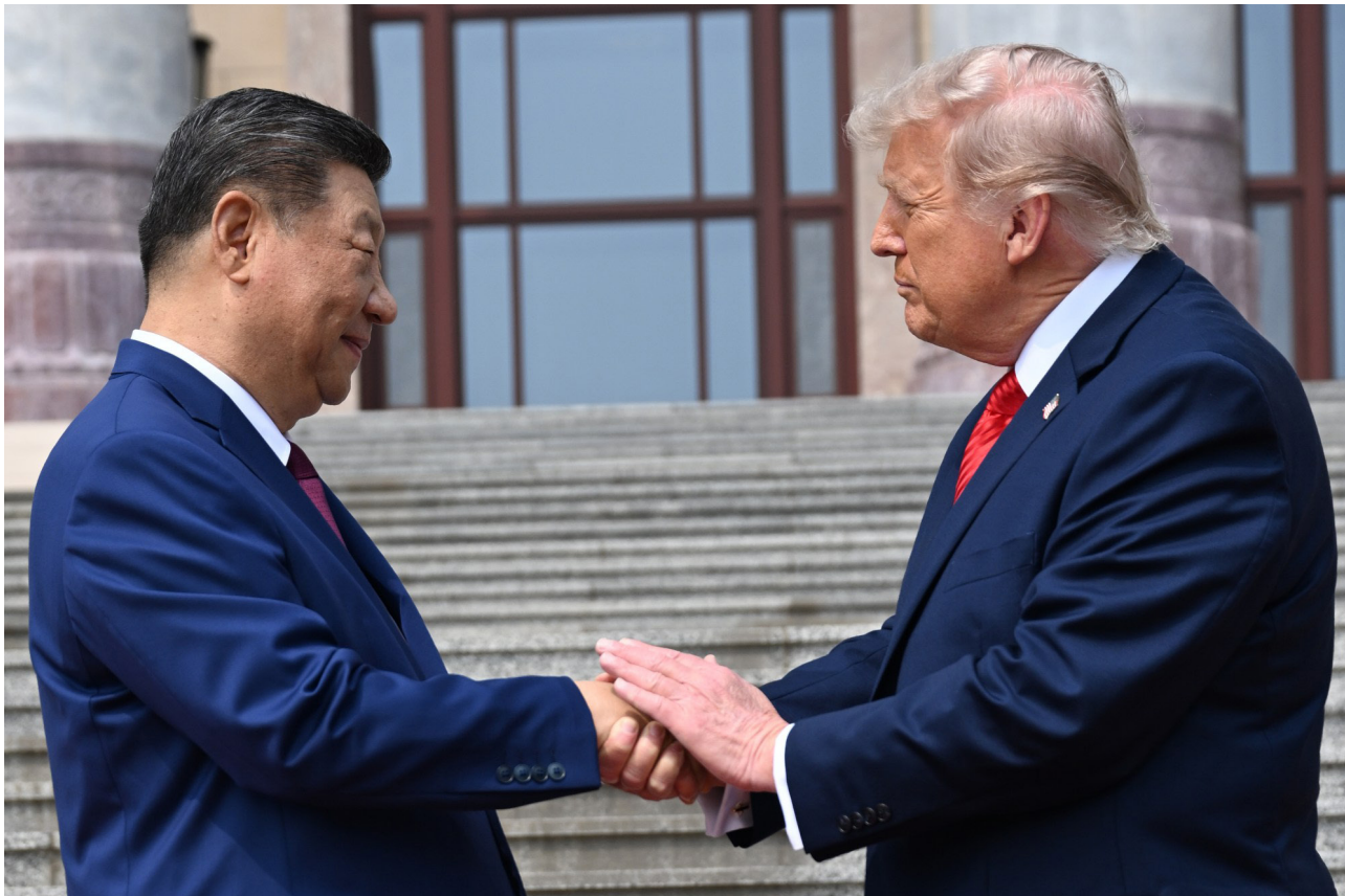
Chinese President Xi Jinping, left, shakes hands with U.S. President Donald Trump at the Great Hall of the People in Beijing on Thursday. Trump said Xi would make a reciprocal visit to the White House on Sept. 24.