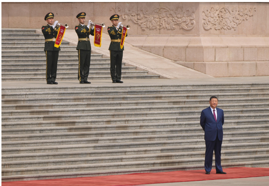
Xi waits to welcome Trump at the Great Hall of the People on Thursday in Beijing. The White House said the trip could lead to announcements on trade.