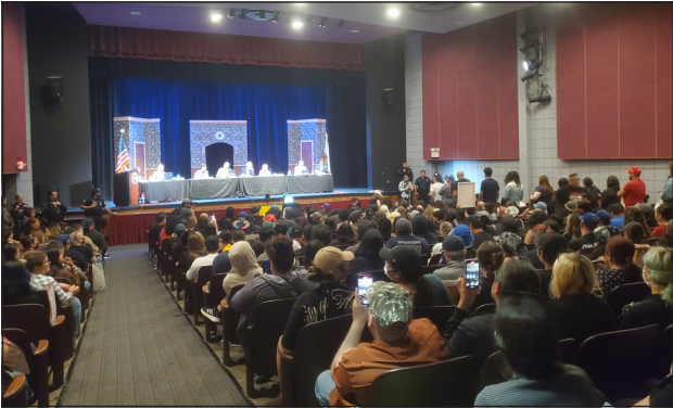
An overflow crowd attends the Whittier City Council meeting on June 10 to protest federal immigration enforcement in Los Angeles County. The council approved an aid resolution Tuesday. ANISSA RIVERA —STAFF