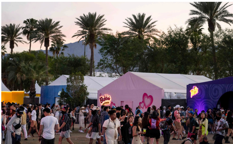
Weekend 2 of the Coachella Valley Music and Arts Festival in Indio on April 20.

It wasn't a seamless transition. After the first festival in October 1999 was awash in red ink, it took promoter Goldenvoice a year and a half to try again — and then in a stripped-down, one-day format. From that uneven start, the festival began to grow steadily, expanding to three days and adding the