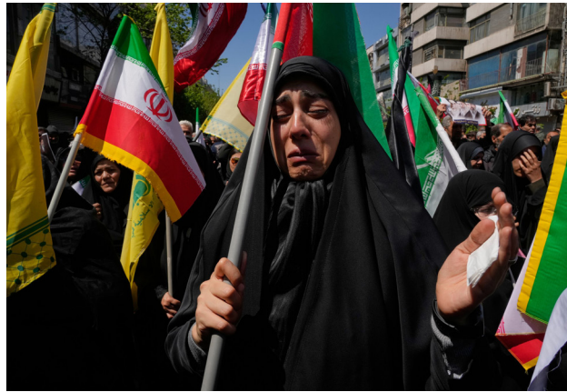
A government supporter weeps during a mourning ceremony marking the 40th day since the death of Iranian Supreme Leader Ayatollah Ali Khamenei, who was killed in the U.S. and Israel strikes in Tehran, Iran, on Thursday.