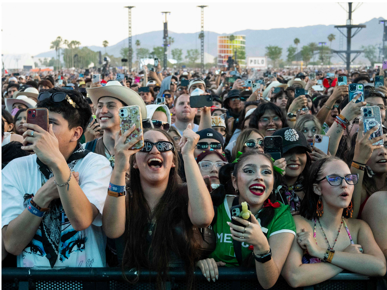
Fans of Junior H react to his performance on the main stage during Weekend 2 of the Coachella Valley Music and Arts Festival in Indio's Empire Polo Field last year.

Today launches 2 sold-out weekends of world-famous music showcase