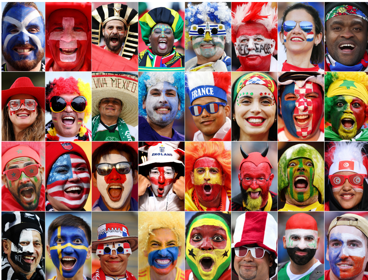
This composite image shows fans supporting their national teams participating in the World Cup in June in the United States, Mexico and Canada. Several factors have some organizers worried about attendance.

Levi's Stadium will host its first match on June 13, but high ticket prices, expensive hotel rooms, visa worries have attendance estimates fluctuating