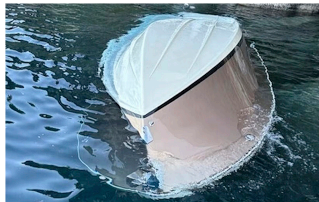
A 27-foot vessel capsized due to a large swell near D.L. Bliss State Park at Lake Tahoe on June 21, 2025. Eight people were killed, with one of the two survivors saying there was "no sense of urgency" when the waves hit.

Eight people who drowned when their boat capsized last June on Lake Tahoe declined requests from one of the passengers to put on life jackets, did not call 911 and tried to bail out water with a beverage cooler as heavy waves crashed overboard, according to a police report released Wednesday.